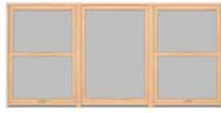
Double-Hung / Picture Window / Double-Hung